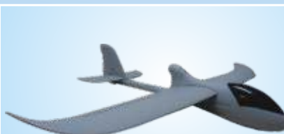
Guardian Civilian UAV