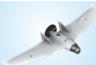
Baaz Mini UAV