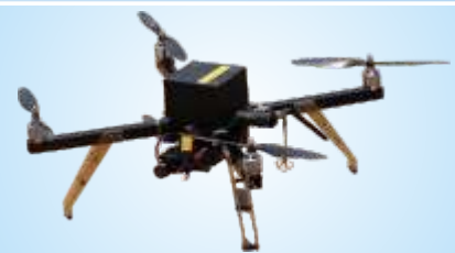
Curiosity Plus Quadcopter UAV